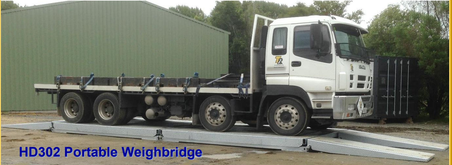
HD302 Portable Weighbridge

Hot dip galvanised or Epoxy paint finish